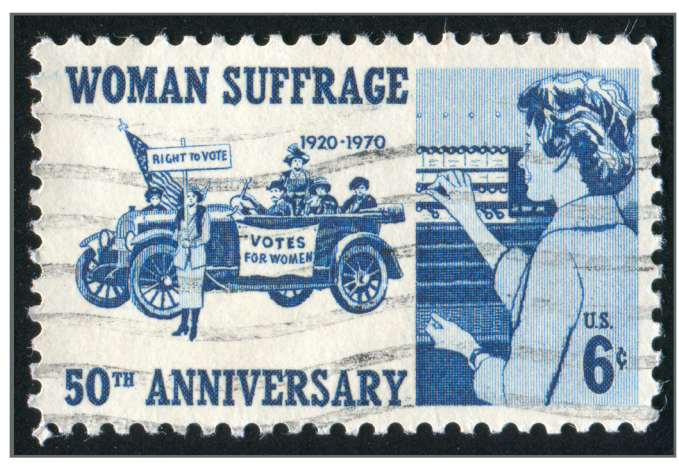
CIVIL RIGHTS REPORTER

March 22, 1972 - The Equal Rights Amendment to the U.S. Constitution was passed by the U.S. Senate and then sent to the states for ratification. The ERA, as it became known, prohibited discrimination on the basis of gender, stating, "Equality of rights under the law shall not be denied or abridged by the United States or by any State on account of sex," and that "the Congress shall have the power to enforce, by appropriate legislation, the provisions of this article." Although 22 of the required 38 states quickly ratified the Amendment, opposition arose over concerns that women would be subject to the draft and combat duty, along with other legal concerns. The ERA eventually failed (by 3 states) to achieve ratification despite an extension of the deadline to June 1982.