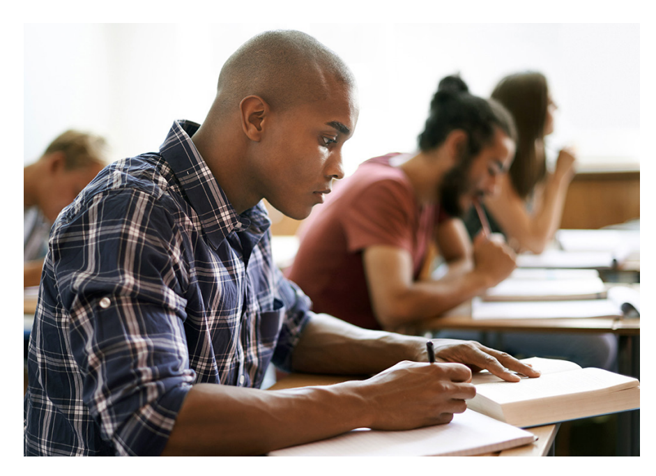
A full list of opportunities is available at: