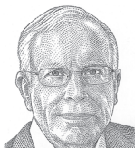
James J. Heckman is the Henry Schultz Distinguished Service Professor of Economics and Director of the Center for the Economics of Human Development at the University of Chicago, a Nobel Laureate in economics and an expert in the economics of human development.