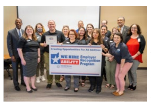
Recognizing Bloom Consulting of Round Rock, TX for efforts in hiring people with disabilities.